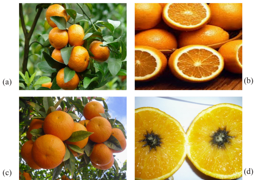
Fig. 3. Orange fruits collected from a controlled area irrigated with potable water (a) with health fruits (b). Fruits from a contaminated site irrigated with wastewater (c) have unhealthy fruits, showing rotting starting in the central axis of the orange and works its way outward (d)

can induce potential risks to human health through accumulation and persistence in soil, (e.g. Yan et al. , 2008). The bad and unpleasant odor of WW and soils indicate presence of different types of pathogens which could further become potential source of entry into human through food chain, people who consume the crops, causing health problems to farm workers, and in the people who inhale aerosols generated from the applications of the wastewater (Chary et al. , 2006; Zhao et al. , 2014).