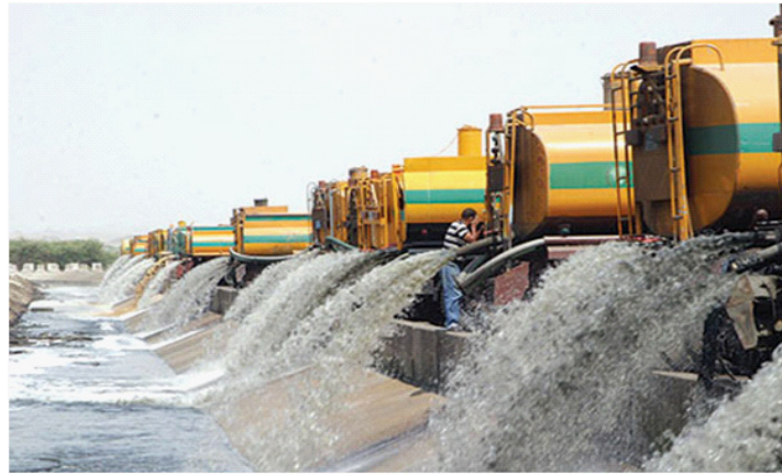
Fig. 1. Turks disposing waste water in the lake

50% lower than those irrigated with PW) (Tab 5). This lower firmness could be attributed to the fungal infection with alternaria that appeared in the central axis of the orange in the form of rot and works its way outward with hardly any external symptoms (Fig. 3 D). SSC and diameter of fruits irrigated with WW were increased by 17 and 34%, respectively, while pH showed insignificant increase (0.15 point) (Table 5). The reduction in pH is very comparable to the reduction reported in Jordan by Shahalam et al. (1998), as they reported a 0.2 unit in the case of freshwater irrigation. It indicated a tendency of the wastewater to lower the soil pH slightly.